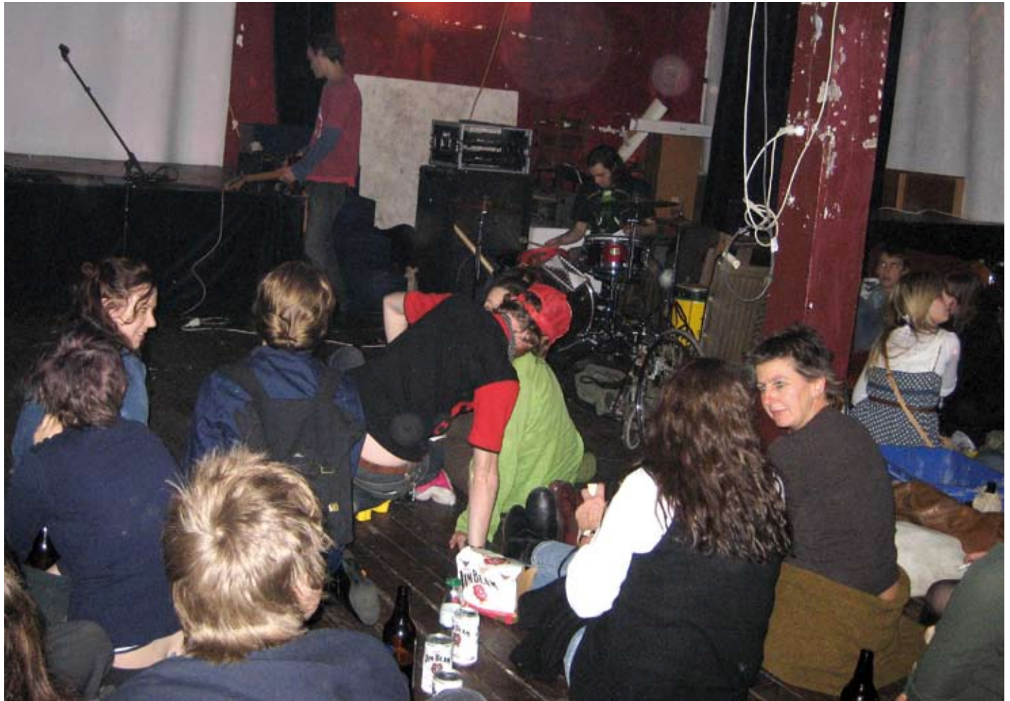
In spite of the rundown appearance of the venue, Sydney band xNOBBQx manages to pull one last crowd at Lanfranchi's in Chippendale.