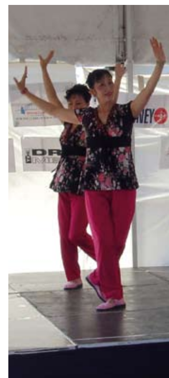
Rhythm from the Western Regime Chinese Association Dance Troupe.

Sydney reggae outfit, King Tide, kept the crowd dancing to their beats, some with careless abandon, long after the 3pm finish for the Festival was past.