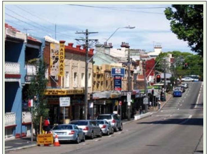
The 'bottom' end of Glebe Point Road near Parramatta Road

Locals say it may be a while before the sound of a child's bicycle bell is heard again.