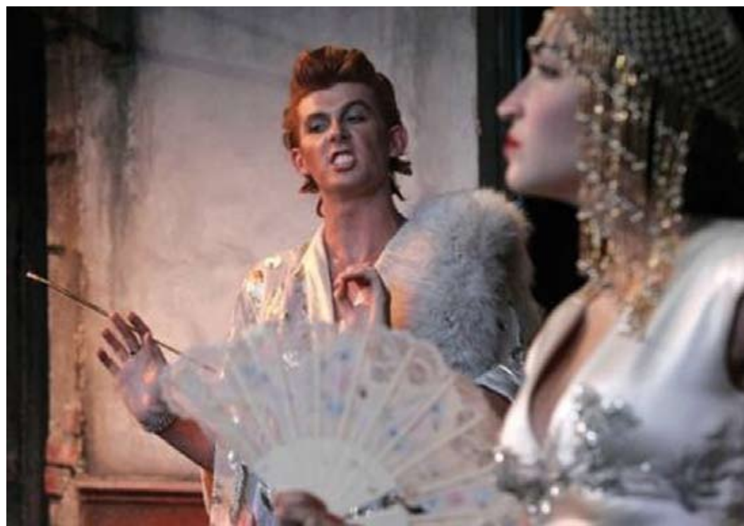
Celebrating 75 years of controversy is blood sucking fun – A scene from 'Vampire Lesbians of Sodom'.

Arthur Miller's timeless The Crucible , in March and April.