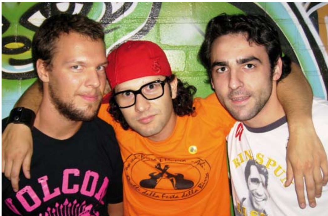
The boys from upcoming band, Dead Kitten Parade, playing it smart at the smARTarts festival in Chippendale.