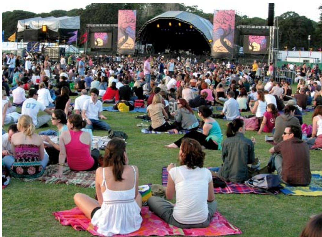
Music fans enjoy the outdoors at music events such as the Missy Higgins concert (above) and Parklife (top).

hosting larger music events than we have in the past and we're capable of doing that."