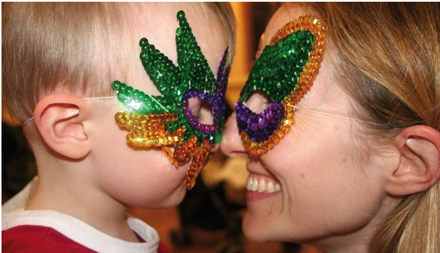
Arts and crafts programs keeping everyone smiling...Toddlers and parents see eye-to-eye at the New South Wales Art Gallery's popular educational program for toddlers.